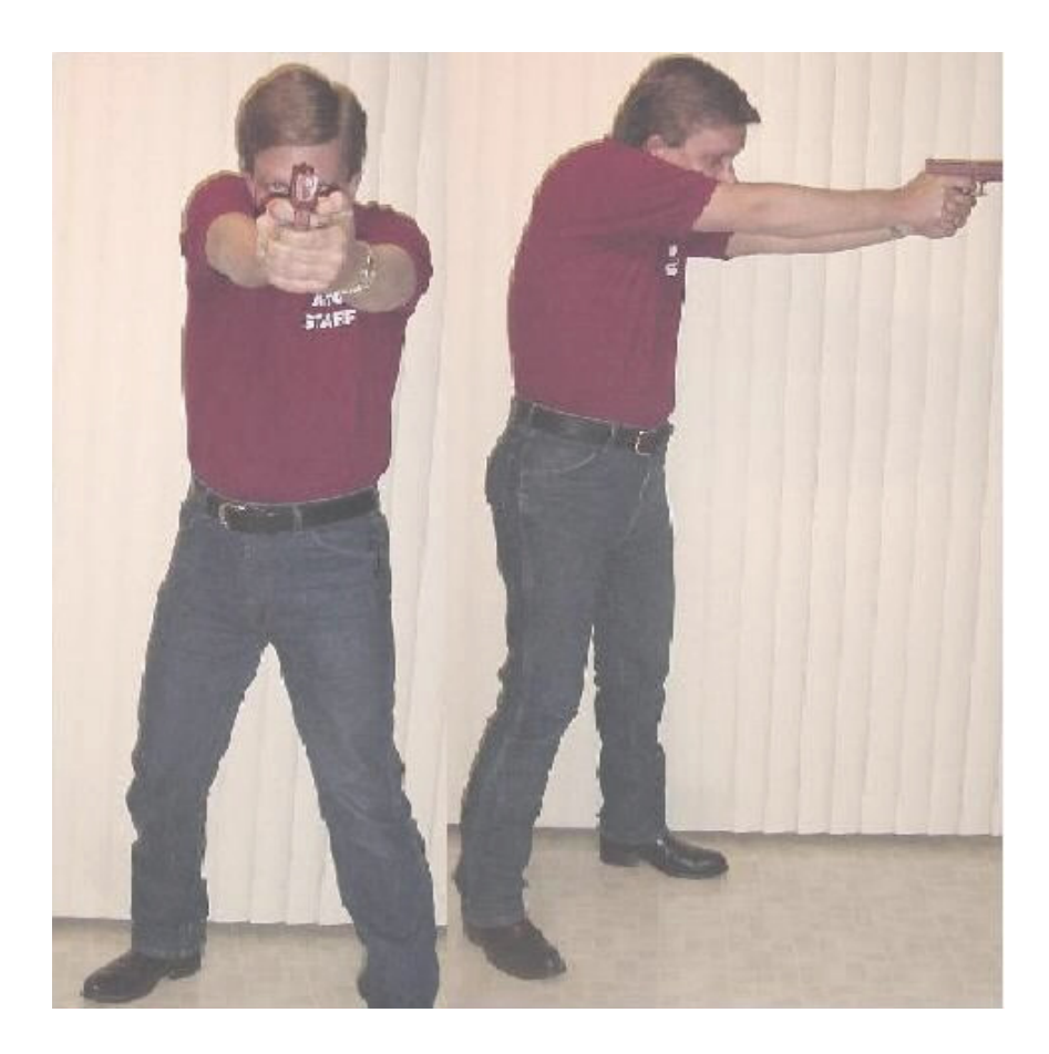
DON'T Be a "Turtle"!